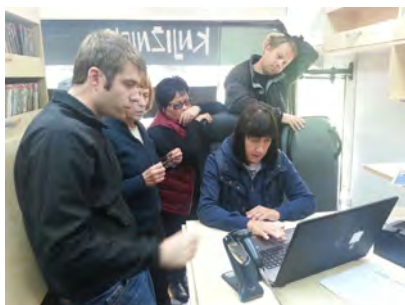
FOTO: TEAM GREAT CONCERN BEFORE THE OPENING: WILL WE MENAGE ON-LINE LOAN?

DESIGNE AND ILLUSTRATION: MATIC BREZOVŠEK AND DOMEN RUPNIK