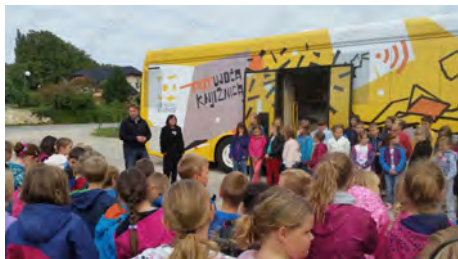
FOTO: THE OPENING STOP IN THE DUPLEK MUNICIPALITY

The vehicle measures 10.8 m in length, 2.5 m in width, and weighs (including the library items) about 15 tonnes. Total prize was 284.506 EUR.