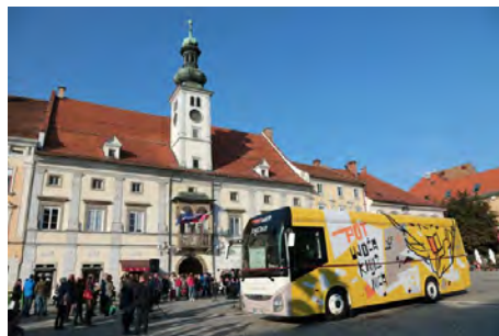
FOTOS: THE MAIN OPENING IN MARIBOR